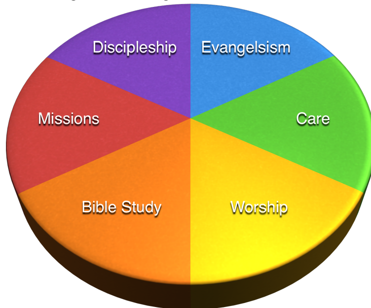
Fig 1 - The Program - Centred Church

In this program- centred view, the church may resemble a secular training institution or small business in its structure and organisation.