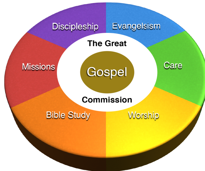
Fig 2 - The Great Commission Church